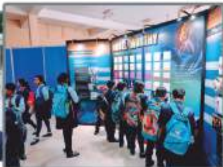
Exhibition on Nobel Worthy