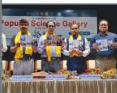
Release of Folder of New Popular Science Gallery at NBSC, Siliguri