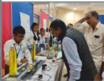
District Science Fair 2022