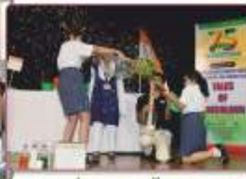
Inauguration of Tales of Tricolour