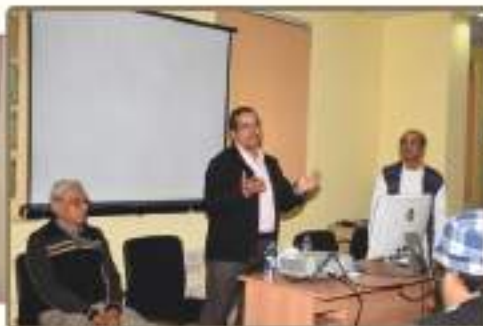
International Photographic Conference