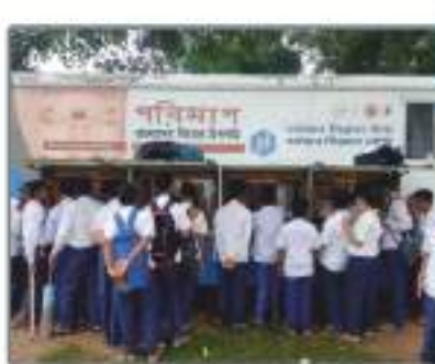
Mobile Science Exhibition