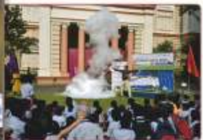
Celebration Children's Day 2022