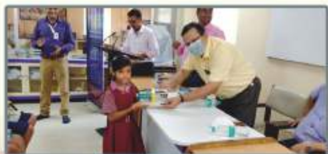
Distribution of Educational Kits to Underprivileged Students