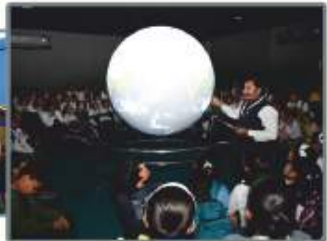
Launch of new SoS show