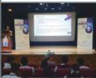
Popular Lecture, National Science Day