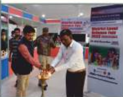
District Level Science Fair 2022