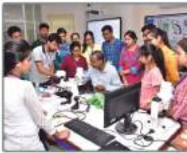
Workshop during the celebration of IDSC