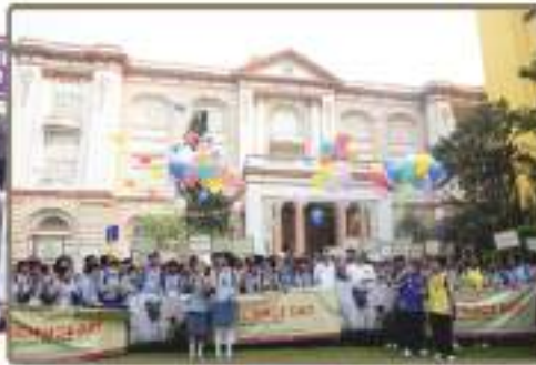
National Science Day 2023