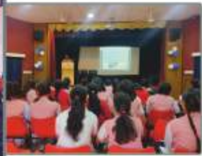
Popular Lecture at DSC, Purulia