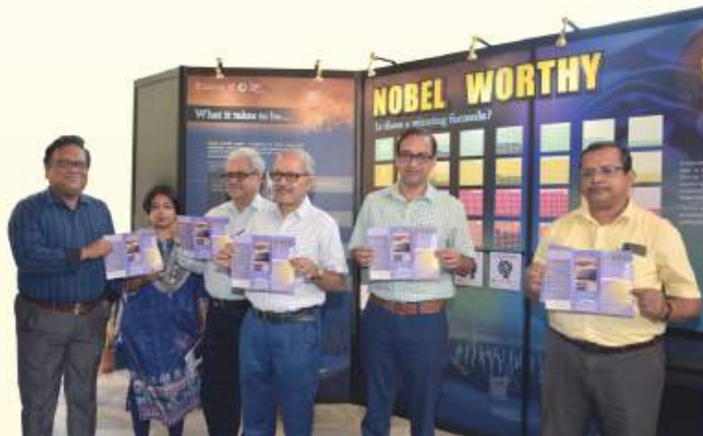
Inauguration of Exhibition on Nobel Worthy ~ what it takes to be