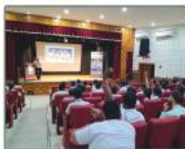
Open House Quiz during the celebration of Moon Landing Day