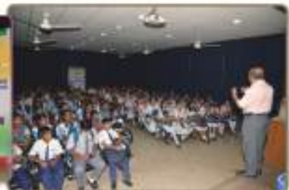
Exposure visit of underprivileged students