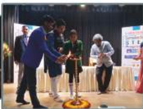
Inauguration of Curriculum based STEM programme