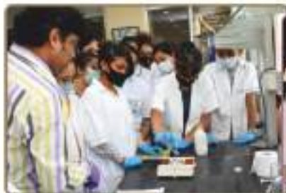
Hands-on Training programme on Biotechnology