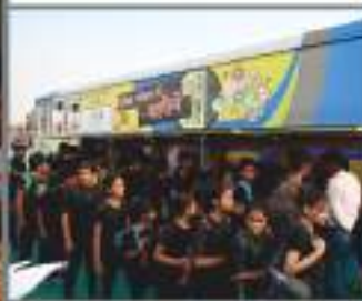
Celebration of Bihar Diwas