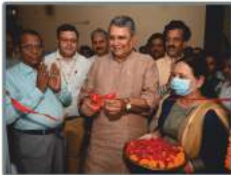
Inauguration of New Ocean Gallery