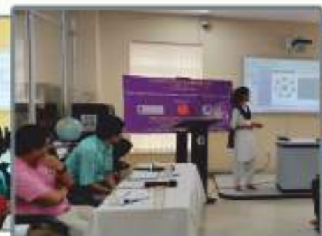
Students' Science Seminar 2022