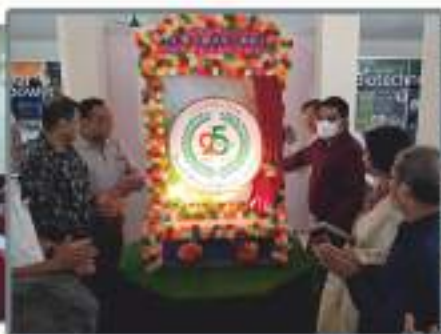
Unveiling of logo of 25 Years of NBSC, Siliguri