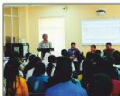
Events on National Energy Conservation Day