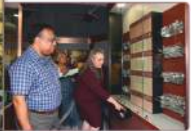
Inauguration of Motive power Gallery 2022