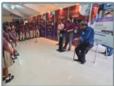
Celebration of International Museum Day