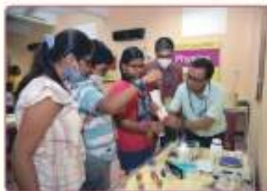
Summer Camp 2022