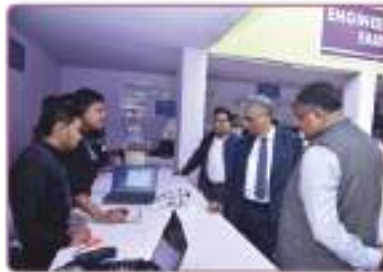
Eastern India Science Fair 2023