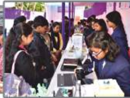
Science Fair at DSC, Purulia